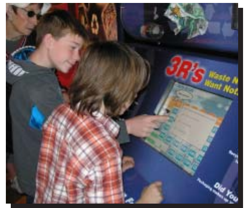
Dubuque County students used interactive displays in the state DNR Educational Trailer to learn about ways to handle solid waste.

Funding for the E-Cubed program was made possible in part by a grant from the Iowa Department of Agriculture and Land Stewardship through the Iowa 4-H Foundation. Last year more than $15,000 in grants were awarded to Iowa counties for programs that educate young people about agriculture and